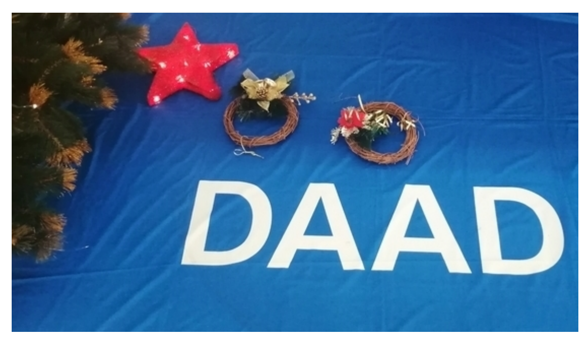
Editorial - December 2019